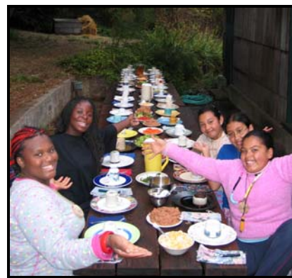
We've prepared quite a feast. Join us!

Join the VV staff team and community at Huddart Park, just outside of Woodside, in one of the Bay Area's nicest and most accessible parks. Enjoy a relaxing time and take a cheese and wine walk with our new naturalists in an amazingly beautiful setting. Be ready to enjoy good food, refreshments and company. Bring your bocce balls and sun hats! See you there!